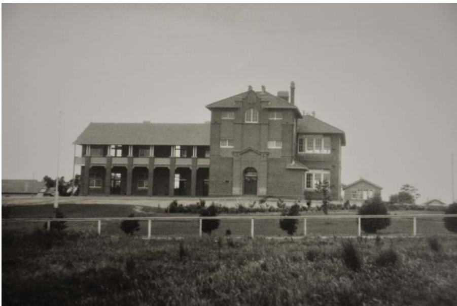
Photograph of Mont Albert Primary School soon after construction, undated