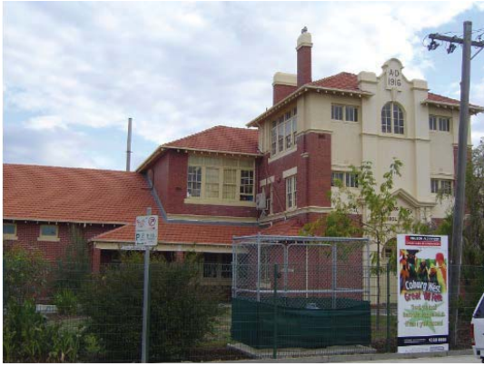
Coburg West Primary School 1916-17