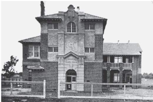
Murrumbeena Primary School 1917