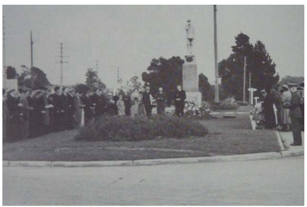
Anzac Day ceremony 1950 before relocation, from D Sydenham, Windows on Nunawading, p 56