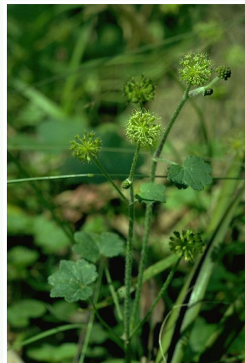
© M. Fagg, Australian National Botanic Gardens

Photographer: Fagg, M. 'Hydrocotyle laxiflora'