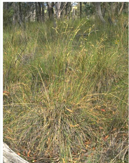
P. Ormay © Australian National Botanic Gardens