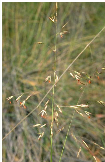
P. Ormay © Australian National Botanic Gardens

Photographer: Ormay, P., 1993 'Joycea pallida'