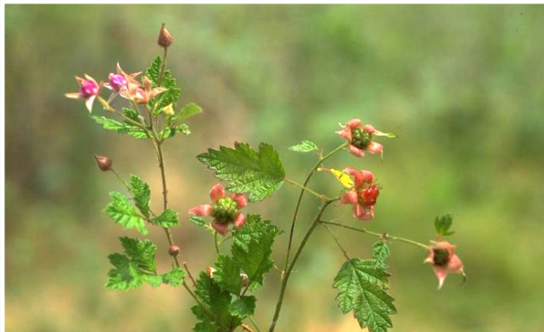
Ormay, P © Australian National Botanic Gardens

Photographer: Ormay, P., 1995 ' Rubus parvifolius '